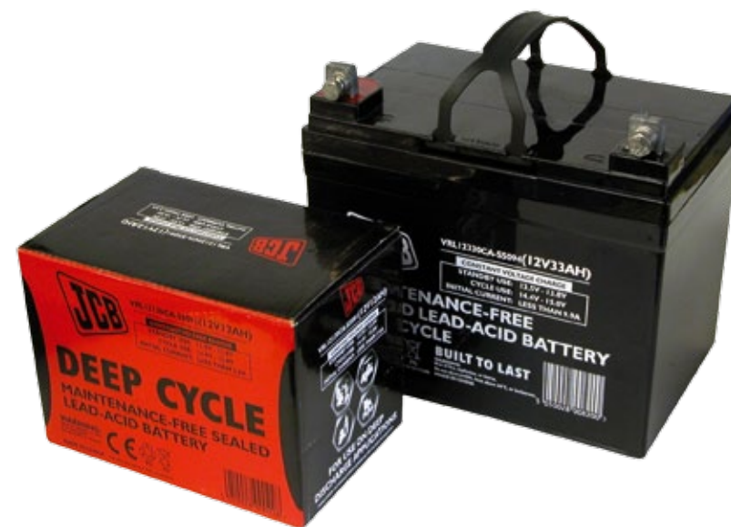
Deep Cycle Sealed Lead Acid batteries for cyclic applications

Deep Cycle Sealed Lead Acid Gel batteries for cyclic applications. The introduction of gel electrolyte to the battery enables it to be more easily recharged when deeply discharged on a regular basis.